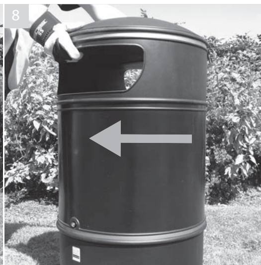
8 Continue to twist hood clockwise until it will rotate no further