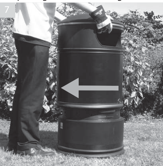
7 Replace hood and twist clockwise until it drops to its lowest point on base