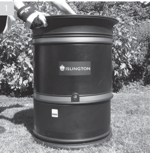
1 The open top round heritage connects and releases from the base in the same way as the Round heritage