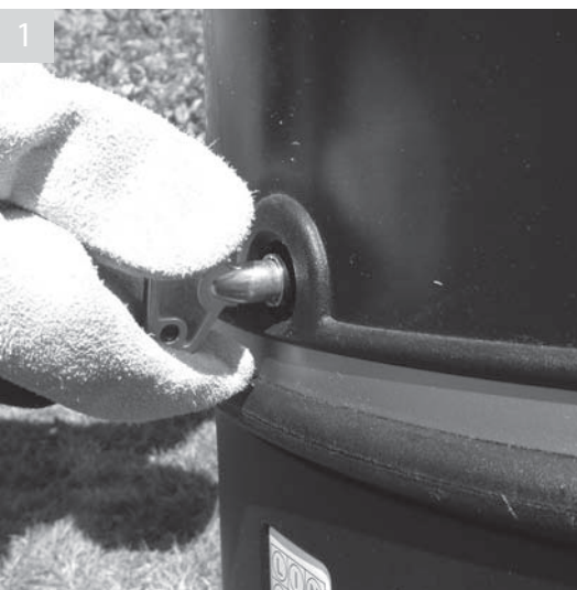
1 Insert key and turn clockwise until stop. Lock will pop out and release