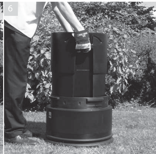
6 Using handles to grip replace liner