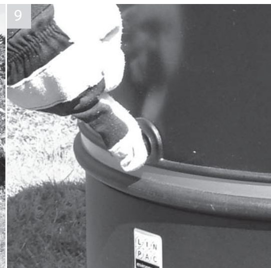
9 Push lock in to engage