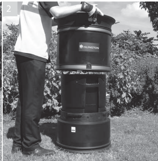
2 Lift hood using rim to grip. Remove and replace liner as with round heritage