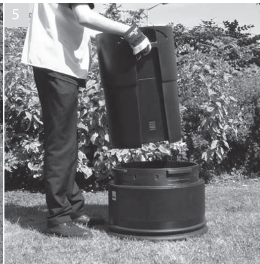
5 Lift liner upwards clearing the bin base and empty