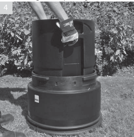
4 Grip liner using the two handles