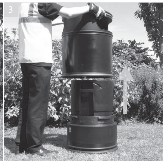
3 Lift the hood upwards clearing the bin liner, place on ground

Round heritage litter bins can be supplied with either plastic or metal liners