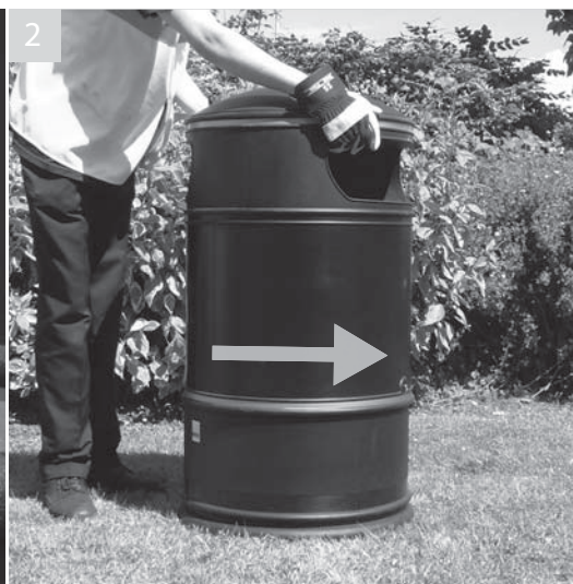
2 Gripping bin apertures twist hood anticlockwise until stop